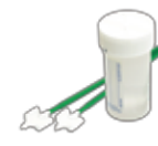
Pap Smear for Cervical Cancer